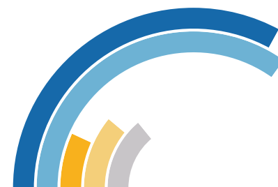
Fixed Income Maturities by five year terms