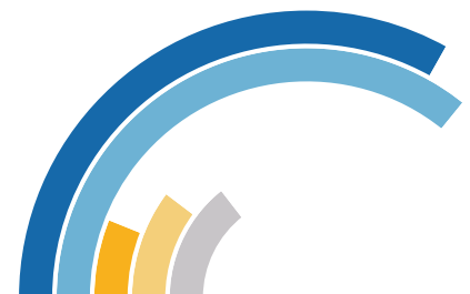
Fixed Income Maturities by five year terms