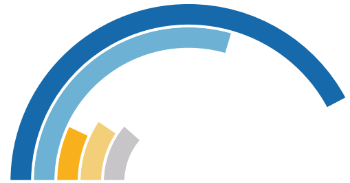
Fixed Income Maturities by five year terms